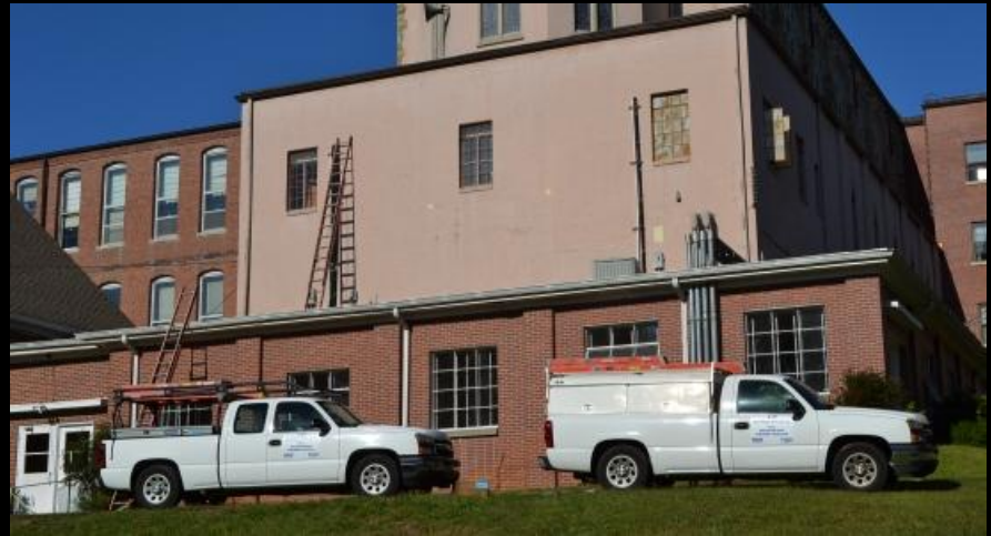
Oct. 4 th Setting up the office & Moving Chapel A/C units to north side of the building