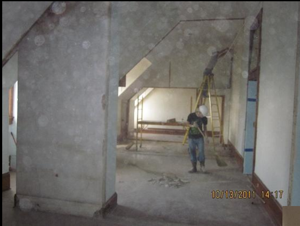
Oct. 13 th – 3 rd Ottilia northwest dormer rooms opened up (see chimney at left); north bathroom demolition