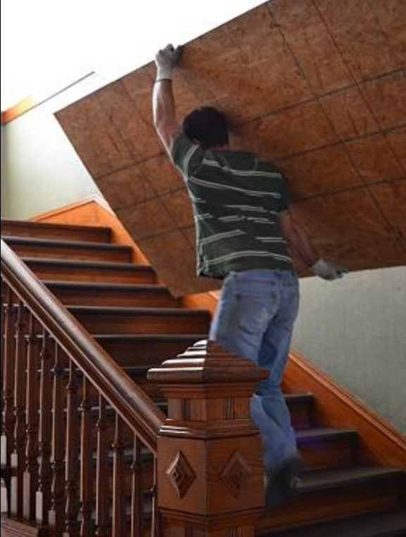
Oct. 7 th Hand carrying materials to 2 nd Otilia, protecting the Pergo floor