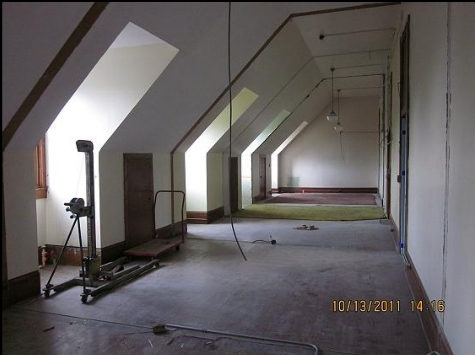
Oct. 13 th – 3 rd Otilia West rooms opened back up